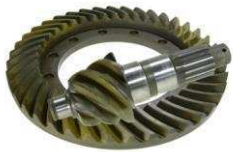
MC809467 68117 CROWN WHEEL/PINION 45:6