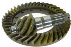
MC809464 68120 CROWN WHEEL/PINION 45:6