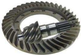
MC804124 60758 CROWN WHEEL/PINION 40:6