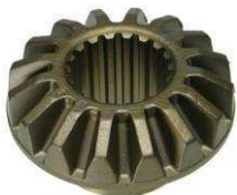
MC814587 68733 SIDE GEAR 16-18 T.