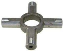
MC804837 68040 SPIDER