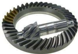
MC806121 70525 CROWN WHEEL/PINION 40:6